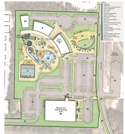
Figure 2: Wheels Fun Park Site Option 2