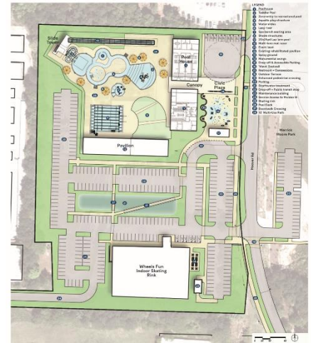
Figure 1: Wheels Fun Park Site Option 1