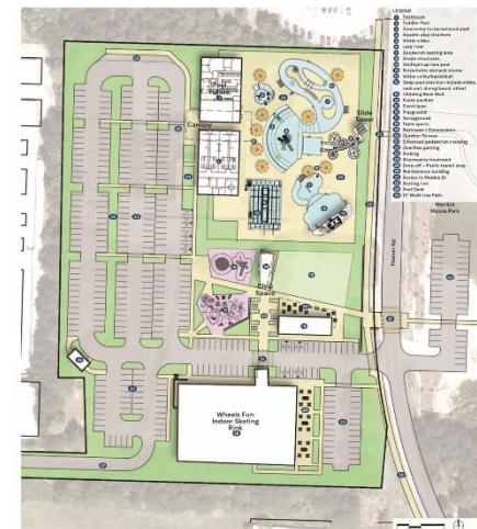
Figure 3: Wheels Fun Park Site Option 3